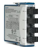
Fig.6 NI 9219