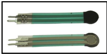
Fig.7 Force Sensitive Resistors (FSRs)

An abridged hardware circuitry had been used for pulse exposure as given in [2]. Here a key for the pressure sensor placement has been provided by the author. Three pressures using pressure sensors are considered. Device could acquire complete multichannel pulse signals, i.e., three-channel of main signals together with the sub signals, and thus more indicative features could be extracted. In future developments, improving the degree of exactness of computerized pulse diagnosis has been projected. The sensor placement in the proposed methodology has been referred from this work.