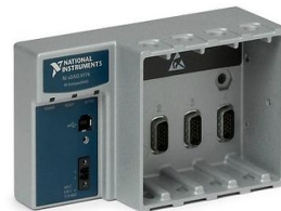
Fig.5 NI cDAQ 9174

Fig.5 shows the Data Acquisition Equipment Compatible with NI LabVIEW. Compact DAQ NI 9174 Chassis and Analog DAQ card NI 9219(Fig.6) are used as the main hardware.