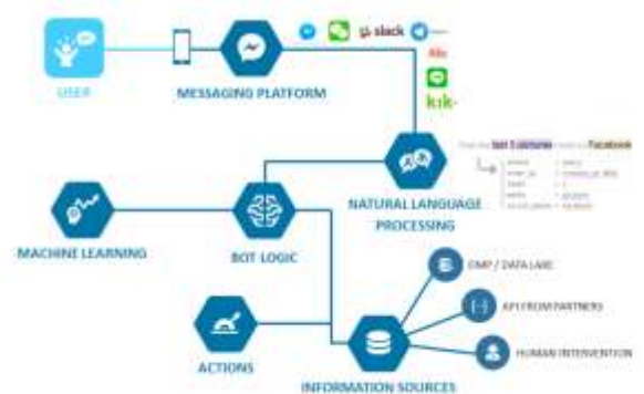
Fig 1- Working of Ai Chatbot

Web scraping collects information from websites in an easily digestible manner, allowing you to make rapid judgments. Using the NLTK library, which was built with Natural Language Processing in mind. Because the user input will be in English, we must allow the machine to comprehend the query language we used for Natural Language Processing.