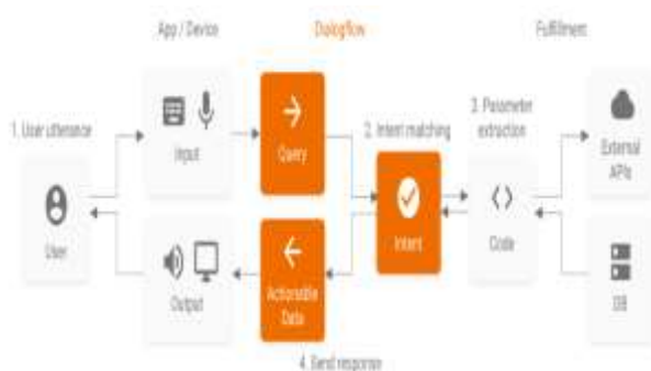
Fig 2.- Flow Chart of The System

however it is required to illustrate how the platform's present implementation would benefit the suggested method. A purpose is made up of three fundamental components: contexts, training instances, and responses. Contexts overlay the dialogue in such a way that only those intents that are present can be engaged while they are present. Sentences are separated into two categories: templates and examples, and they are utilized as training examples. Each of these statements is labelled with entities or the simple aim in which it is included. Responses are triggered when a user entry matches an intent since they are the outputs of intents. They are available in several forms, with plain text being the most prevalent. Direct connection with apps that fit content into cards, tables, lists, and other content structures is possible with Dialog flow. Entities, as previously stated, are keywords that may be classified in a variety of ways. Creating an intent for each definition is an alternative for educational purposes; this way, data from students' interactions with the bot may be grouped not just using individual queries, but also using these broader structures. Apart from the value of analytics, there is also a benefit for intent detection, because every time an item is discovered, the number of probable intentions that match the query is decreased.