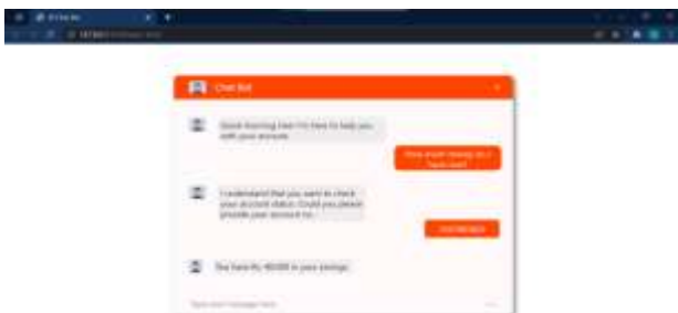
Fig 3- User Interface Ofai Chatbot

generate a new response to Welcome Purpose. When an expression is entered in the "Responses" section, the responses for MCA Department Bot are chosen at random. And custom response enables us to create a unique welcoming response for the Department bot. Step 3: Developing New Intentions We're developing an MCA Division Bot to assist users with a few answers: "How long is the MCA course?" "When do colleges begin?" "What are the class times?" We'll create Intents for all of these query forms and then initialise them with the appropriate Expressions and Responses. To create a new Intent, simply click the '+' button next to the "Intents" click inside the left menu. When going to name an Intent, keep it simple and easy to remember. Step 4: Including the Response By including responses but rather expressions such as "It is a three-year course with a two-year lateral entry," "we are open Tuesday morning through Sunday from 6 a.m. to 11 p.m.," and "classes begin at 8 a.m. and end at 5 p.m." After that, set the Intent to "end of conversation" at the Training phrases. Integration is the fifth step. The following paper indicates how to incorporate the MCA Department bot: To begin, go to the "Integration" section of the left column and turn "Web Demo" On, then tap it to enter.[12]