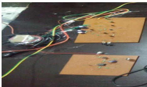
Fig. 1- Working Model of IR Sensor

This project detects if any worker is entering inside the department or not. If some workers enters the working chamber or machinery room the lights will be on and if no one is present in the working room the lights will be off. If there is no one in the working chamber or in the plant then in that case if the lights or halogen bulb near the convey or belt or the boiler is continuously on so this wastage of electricity will cost heavy bills for the company. By using this system the wastage part can be easily overcome and more important than that this circuit is wireless and automatic on off lights so need for manual working for switching off the lights every time.