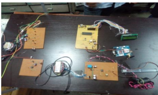
Fig. 5 - Photo of Working Model Project