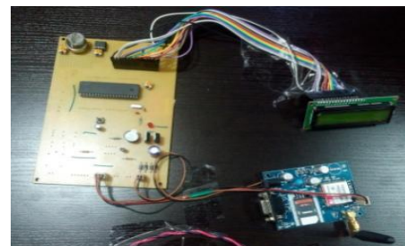
Fig. 2 - Working Model of GAS Sensor

It uses LPG gas sensor to detect the gas leakage. If there is leakage then buzzer is turned on. Specially in the cooking gas industry they have to be very careful with whatever they are working or designing. Because there are thousands of pipes that bypass the LPG gases from inlet of pipe to another outlet of pipe. If there is leakage in the pipe due to any reasons in the night time or any time there might be chances of getting major incidents of end of workers. This system can protect the workers all damages. Sending of data will be there if the gas is leakage on the registered mobile number.