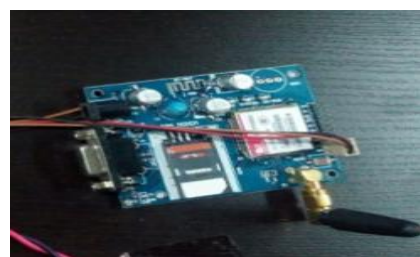
Fig. 6 - Photo Of GSM Model

GSM Modem: We are going to use sim300 as a GSM modem. The status of persons inside the room, LPG Gas leakage status will be sent to GSM modem.