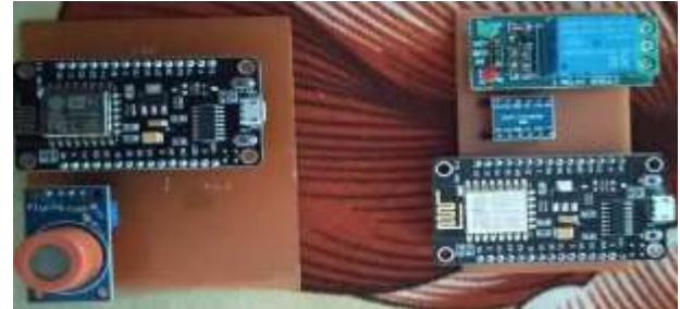
Fig.4- hardware of alcohol detection

mobile phone as a short message (SMS) at his request. The microcontroller gets the information regarding the alcohol through the alcohol sensor and alerts about the condition being sensed using Buzzer and also automatically the motors of the vehicle turns off using relay switch.