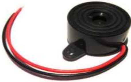
Fig. 3 Buzzer