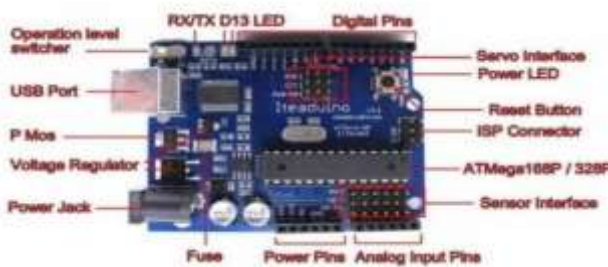
Fig. 1- Arduino Board Discription

The arduino board serves as the system's brain. The ATmega 328 microcontroller board is used in the Arduinouno. It's an electromechanical prototype microcontroller with programmable capabilities. It includes 14 digital input/output pins (six of which can be utilised as PWM outputs), six analogue inputs, and sixteen MHz ceramic resonators. The arduino is different from the other boards in that it does not use the FTDI USB to serial driver chip.