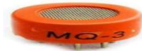
Fig. 2.- Alcohol Sensor

The MQ3 alcohol gas sensor is designed to detect alcohol and can be used in a breath analyzer. Alcohol sensitivity is strong, but benzene sensitivity is low. The sensitivity of the MQ3 gas sensor can be changed using the potentiometer. The sensitive material is SnO 2 , which has a reduced conductivity in clean air. When the target alcohol gas is present, the sensors conductivity increases along with the gas concentration, and a simple electrical circuit is used to convert the change in conductivity to a gas concentration output signal. The MQ-3 gas sensor has a high sensitivity to alcohol and is resistant to fuel, smoke, and vapour interference. It has a 2 metre fine sensitivity range. The sensor can detect varied concentrations of alcohol; it is inexpensive and suited for a variety of applications.