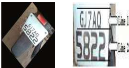
(a) Skewed image (b) Number plate with lines