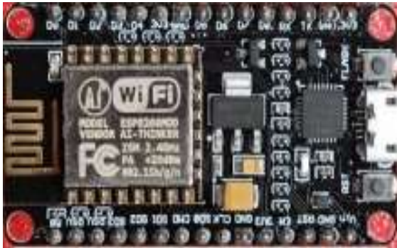
Fig. 2 -Node MCU 2.4GHz ESP 12

Current Sensor ACS172 is the hall effect based sensor that can accurately detect AC or DC current. It works on 5V DC and it can detect current range till 30Amps