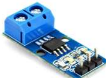
Fig 3- Current sensor

Current Sensor ACS172 is the hall effect based sensor that can accurately detect AC or DC current. It works on 5V DC and it can detect current range till 30Amps