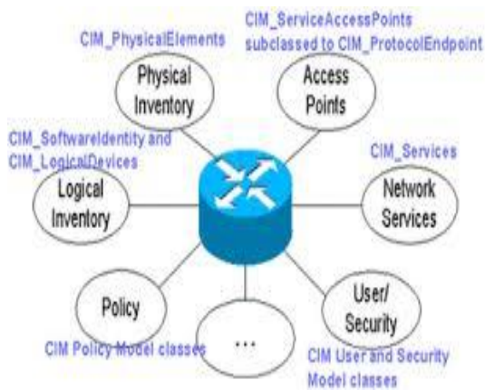
Figure 1.2 working framework of Hardware and software of CIM

CIM Programming involves PC projects to complete the accompanying capacities