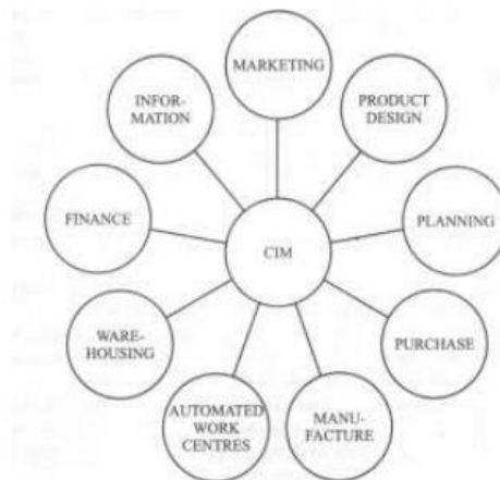
Figure 2 Elements of CIM system