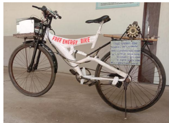
Fig.3- Actual view of Free Energy Bike

The major challenge is facing in the project is to work the project properly and get the final out which is charge the batteries. When we start ignition on the front panel which is key holder start the accelerator to motor the motor connected with back wheel start working the bike move forward. When the back wheel start rotating the pulley attached with wheel also start rotates and the alternator and pulley connect with help of belt that for alternator also start rotating. The alternator is device which convert mechanical energy into electrical energy, so alternator start generate AC charge for our system to charge batteries we need DC charge so with help of rectifier and step up mixer we get the DC output and charge our system batteries.