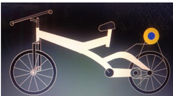
Fig. 2 - 3D view of Bike