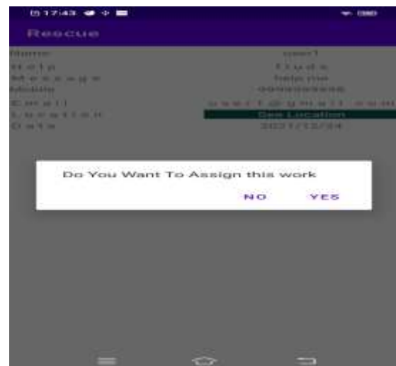
Fig.6.3 Assign the work