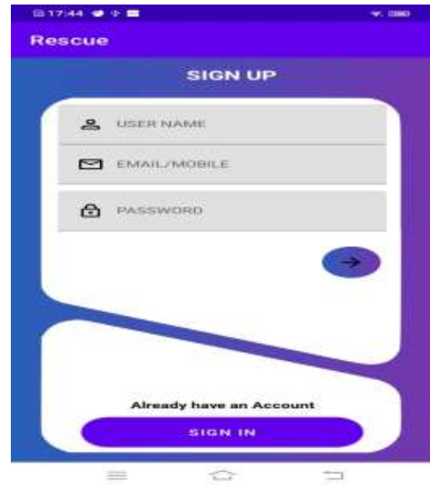
Fig.6.2. User login page