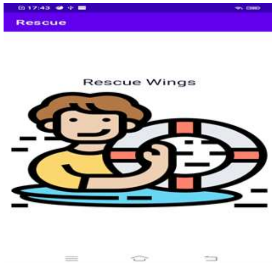
Fig 6.6 Recue wings