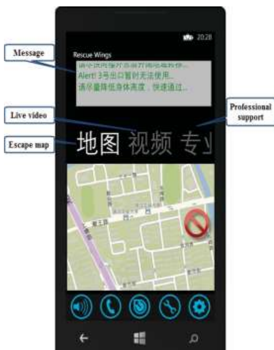
Fig.2 basic Rescue wing

Figure 3 shows the main client application interface in emergency mode, which adheres to the user's emergency program design principles. ([1–3]). Important notifications from the Rescue Wings server are scrolled to the list box at the top of the screen. The icon buttons below will quickly turn on / off voice information, call most commonly used phone numbers, important payment search (e.g., near exit, refuge, victims, etc.), open normal tools, and change basic app settings... The center pivot control is made up of three parts (pages): • The Escape Map page, which shows a map of the catastrophe region with dynamically marked and updated significant objects including victims, rescuers, escape lines, exits, dangerous zones, and so on. The user's location is usually set as the middle. • The Live Video website, which shows real-time video of the environment around critical disaster targets. • The Professional Support website, which allows you to communicate with professionals who can assist you via text, graphics, or audio communications.