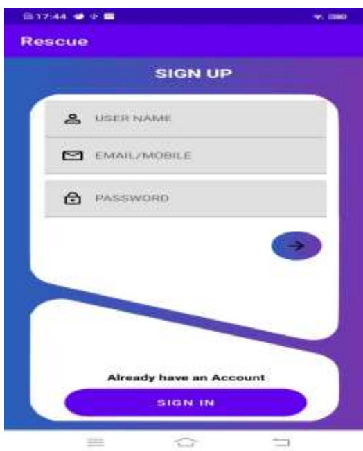
Fig.6.1. Home page