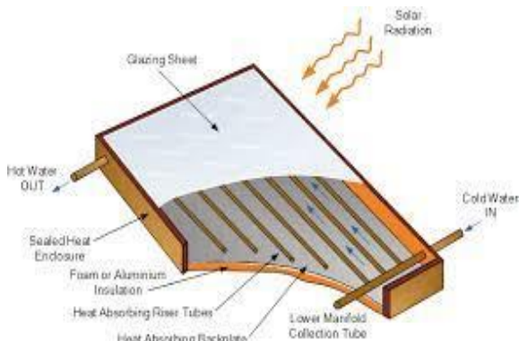
Figure 2: Cut Section image of collector [12].