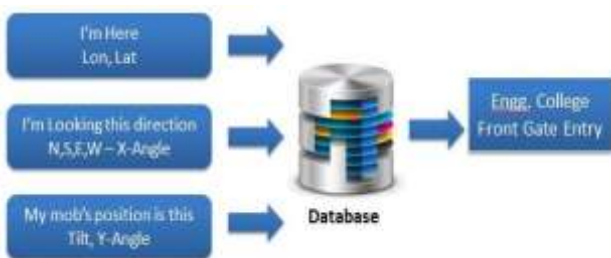
Figure 3.0: Database Retrieval Process

As you are moving in the street and you don't know exactly where you are standing. Then you just need to hold the phone in your hand and open the camera. As soon as user open the camera instantly a pop up will appear on your mobile screen indicating names of the tower, buildings when you move the camera in front of that particular building.