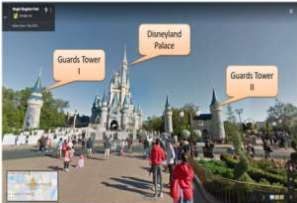
Figure 2.0: location analyzing

As you are moving in the street and you don't know exactly where you are standing. Then you just need to hold the phone in your hand and open the camera. As soon as user open the camera instantly a pop up will appear on your mobile screen indicating names of the tower, buildings when you move the camera in front of that particular building.