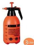
Hand syringe or sprayer

Hand sprayer is one of the simplest sprayer. It consist of non-return valve which is placed inside the piston. The spring is then inserted between the top and the piston this subassembly is included in casing. The trigger is then inserted into the casing through two holes. When the trigger is squeezed it lifts up on the piston until the spring is compressed against the top within the cylinder. This feed smaller volume within the main cylinder which forces the liquid up through the nozzle. When triggers release it forces the piston back down into the bottle non-return valve within the piston cylinder assembly prevents any liquid going back into the bottle once it drawn up from cylinder.