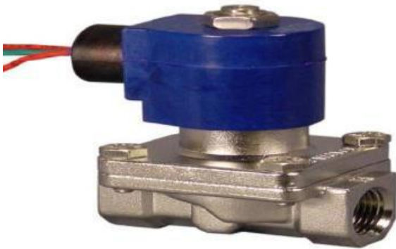
Fig. solenoid valve