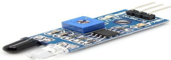
Fig. IR SENSOR

The most popular sensors used in remote sensing are the camera, solid state scanner, such as the CCD (charge coupled device) images, the multi-spectral scanner and in the future the passive synthetic aperture radar. Laser sensors have recently begun to be used more frequently for monitoring air pollution by laser spectrometers and for measurement of distance by laser altimeters . The sensor is used to detect the obstacle