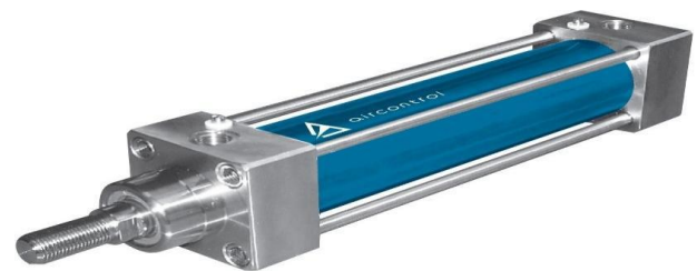
Fig. single acting cylinder

PNEUMATIC SINGLE ACTING CYLINDER: Pneumatic cylinder consist of A) PISTON B) CYLINDER