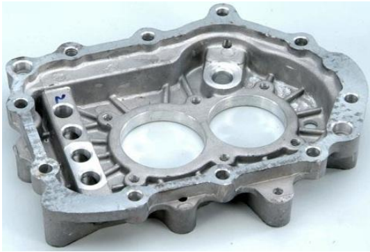
Fig-1 Fig Shows Gearbox casing