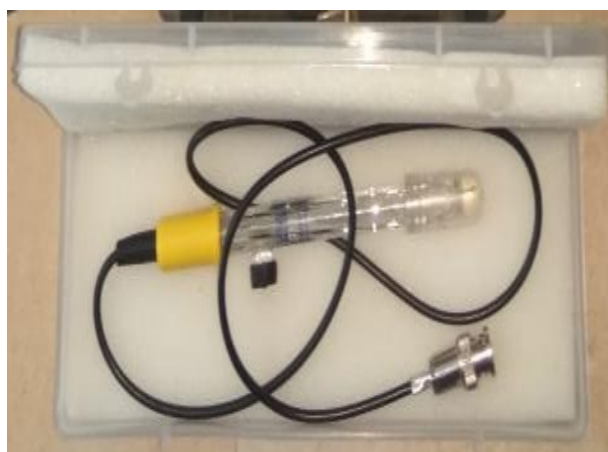
Fig. 2.4:- pH