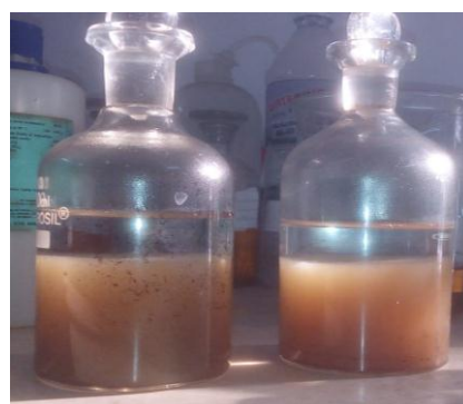
Fig. 2.6:- dissolve solids