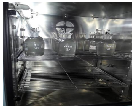
Fig 2.5:- biological oxygen demand