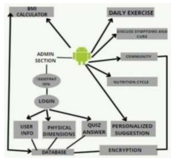
Fig. 1: System Design of Smart Health Care

Block diagrams are often used at a higher level, less descriptive, to clarify a general idea without worrying about the use of context. As shown in Figure 1.