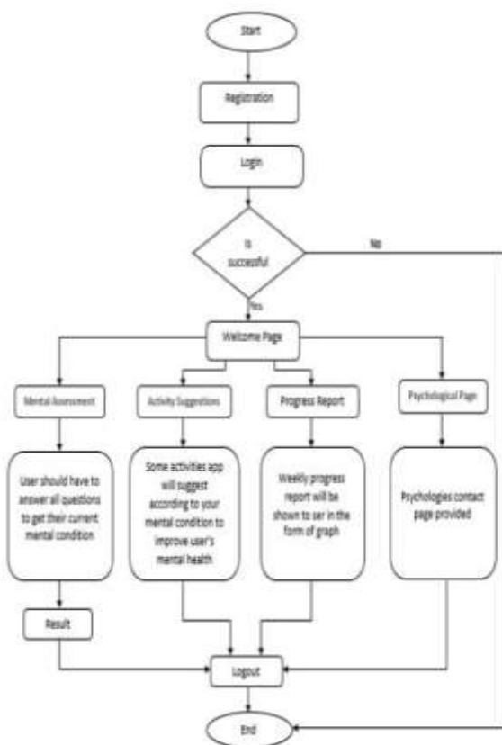
Fig.2- Flowchart of Smart Health Care

In this application we will start with instructions on how to use this application after the login page appears. If the user is not logged in, the user can register. After that, the user will be asked some questions. Based on the answers given by the user, describe the thinking state and the current thinking and present the results to the user. Users can view their mental health by graph. According to the report, users will be advised to work to improve their health. Finally, the app provides contact information for some psychiatrists. If the user needs help from a psychologist, then he or she can seek help from a psychologist. This application is a user friendly application. The user interface of the application is easy to use and the power is easy for users to understand.