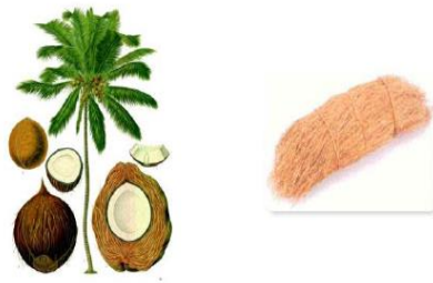
Fig. 1. Coconut Tree, Coconut and Coconut fibres