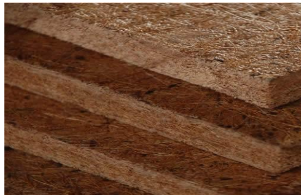
Fig.1 coir Board

husk of the coconut fruit, is a versatile natural fiber with diverse applications in agriculture, textiles, and other industries. The extraction of coir fibers from coconut husks is traditionally a labor-intensive and time-consuming process, hindering the industry's growth and productivity. To address these challenges, this project focuses on the design and development of a coir making machine that automates the process of extracting coir fibers. The machine aims to revolutionize the coir industry by increasing efficiency, improving fiber quality, and reducing the dependency on manual labor.