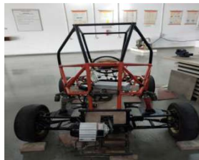
Figure 2. Set up of electric vehicle