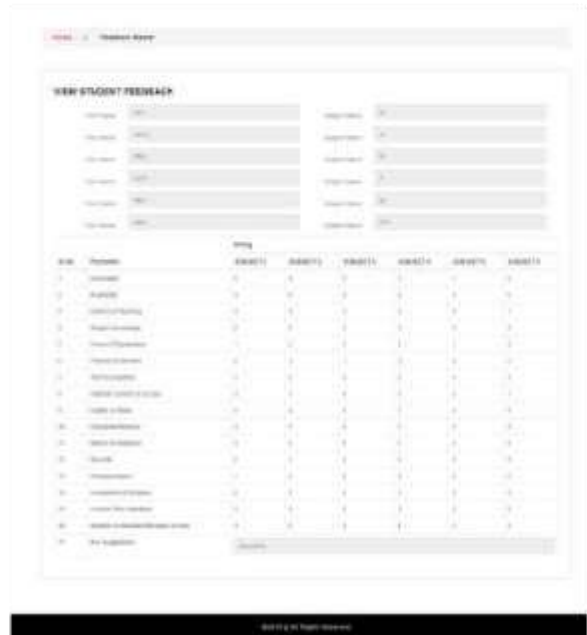
Fig3. Feedback Form